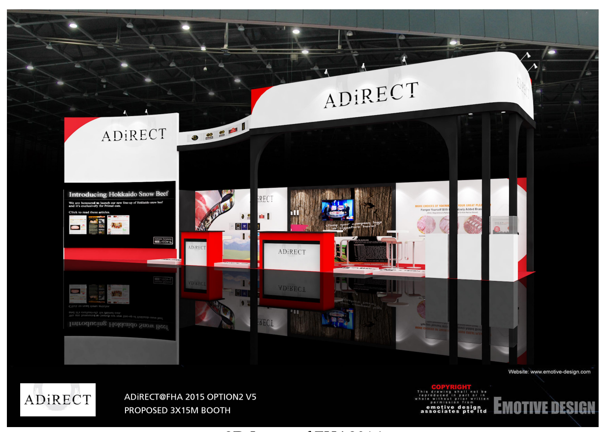
3D Image of FHA2016